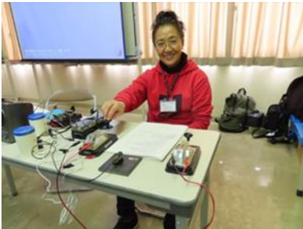
In 2020, at a CW seminar, just before the spread of the COVID-19 virus.