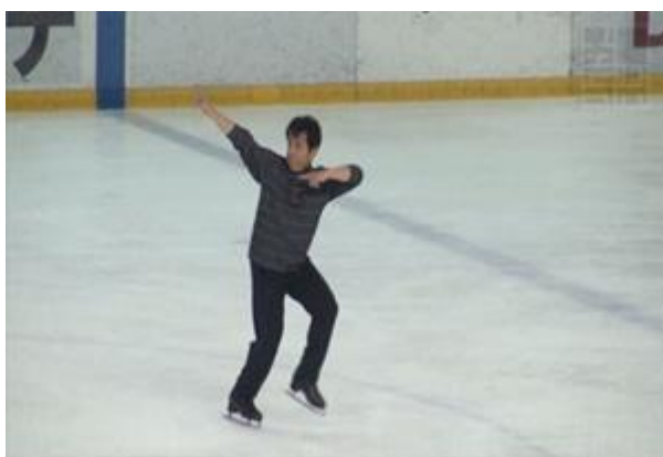
As a hobby, MASA is also a figure skater.