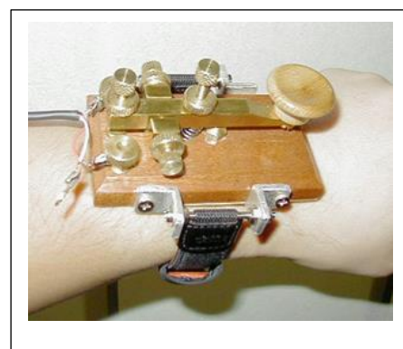
YUKI is also a walking station.