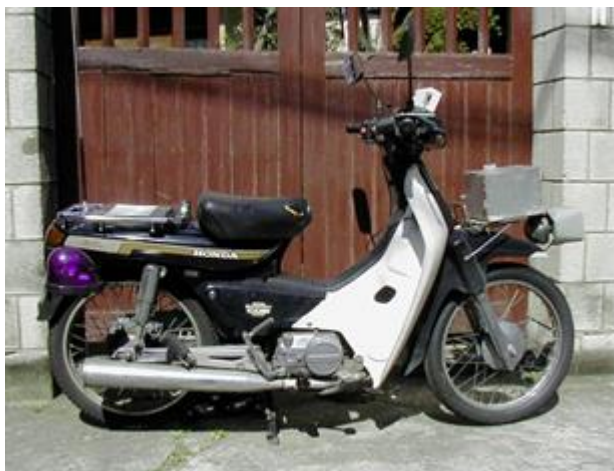
YUKI's bike mobile station