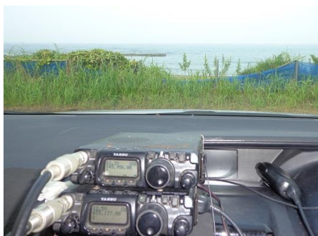
Operation of 2 Sets of YAESU FT-817