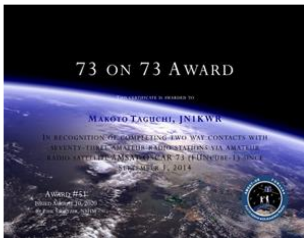
73 ON 73 AWARD

JN1KWR/MAC enjoys Satellite QSO Operation and receives awards.