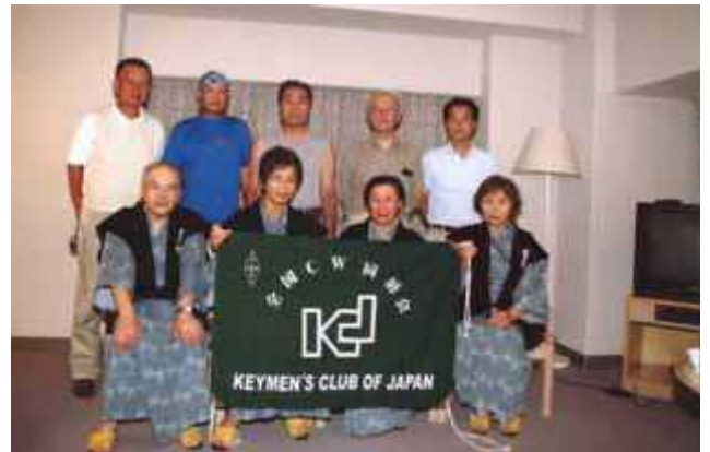
JA7GAX JE8JYD JA7DAY JA8AJE JA8PMN JA8OHG GAX's XYL OHG's XYL JR8THP

The participants were also interested in JA7GAX's DXpedition stories.