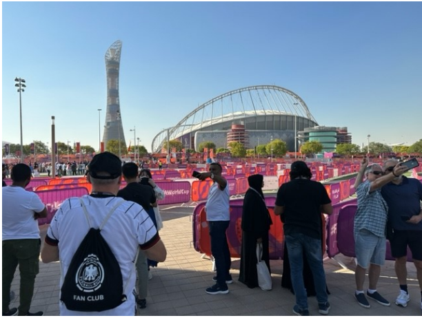
Khalifa International Stadium The most auspicious venue for Japan National Team of Football ▪ The Asian Champion at the Asian Cup in 2011 ▪ FIFA World Cup Qatar 2022 Victory over Germany Victory over Spain

The time has come for the fateful battle against Germany. After greeting QARS members, I took the subway from Red Line Katara Station to the hub station Msheireb Station and arrived at Gold Line Sports City Station. I was in tears when I saw Khalifa International Stadium in front of me. This is my very first opportunity to support Japan National Team of Football at World Cup finals.