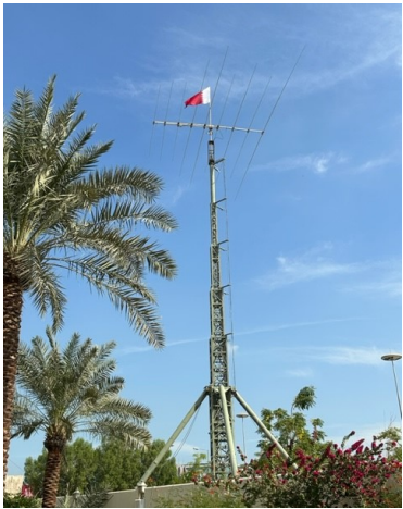
A722FWC Antenna (FT8)

The time has come for the fateful battle against Germany. After greeting QARS members, I took the subway from Red Line Katara Station to the hub station Msheireb Station and arrived at Gold Line Sports City Station. I was in tears when I saw Khalifa International Stadium in front of me. This is my very first opportunity to support Japan National Team of Football at World Cup finals.