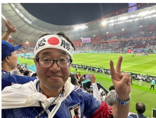
Victory over Spain

During 2022 FIFA World Cup Qatar 2022, I stayed in Doha, the capital of Qatar, as a supporter of the Japan National Team of Football, and witnessed the victories over Germany and Spain. At the same time, it was the days of the operation of A722FWC, the competition commemorative station at QARS. I will write about a number of dream-like events without wearing any Masks then.