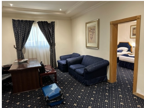
The hotel in the central part of Doha where I stayed during the victory over

It was the shocking defeat against Costa Rica that completely changed my feelings and plunged me into the abyss.