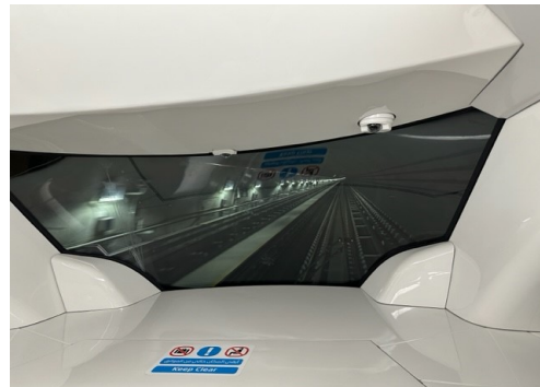
An extremely popular Spot Top of a Doha Metro Train

At usual FIFA World Cups, they hold the games in wide areas, so this time, 64 games in 8 stadiums all in the suburbs of Doha, is a rare case.