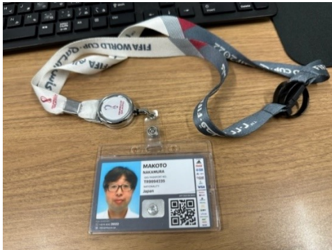
Hayya Card Both for an entry visa to Qatar and a free public transportation