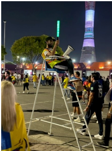
A DJ Policeman Repetitive movement of a large penlight ONLY

From the stadium to the nearest metro station, a Qatari Policewoman guided the guests by singing “Twinkle, Twinkle Little Star.” I heard The volunteers’ Guiding song " Metro This Way " many times at several stadiums. In fact, it has become a hot topic in many countries, and I found Google searches reached 1.18 million hits.