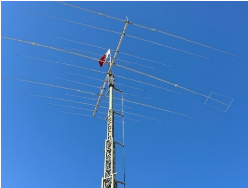
A722FWC Antenna (CW, SSB)

QARS is located very close to Doha Metro Katara Station. I visited by subway on and after the next day. Thankfully, the QARS giant beam antenna was a perfect landmark, and I was able to easily visit QARS by myself even when I reached at a wrong subway exit.