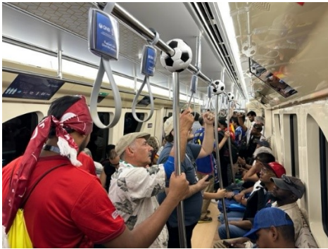
Bitter enemies in the same boat Inside a Doha Metro

As a result, I rode Doha Metro with supporters from all over the world, and people from foreign countries I had never met said unanimously, "Japan is amazing. Japan is very strong" I also replied, especially to the victorious nations, "You're strong, too!"