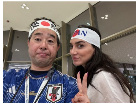
Commemorative Photos after Victory against Germany (Evidence for My Goodwill Grass-Root Diplomacy)