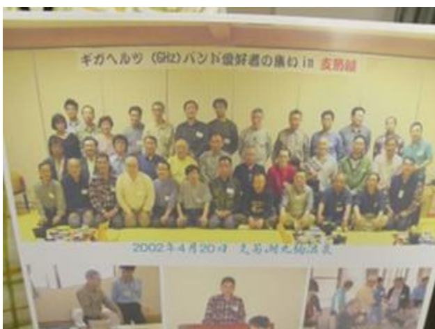
Gathering of GHz band lovers at Lake Shikotsu (Hokkaido)