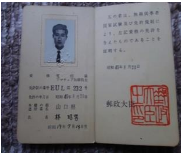
AKI's first CW license issued by the Minister of Posts and Telecommunications in Japan in 1970