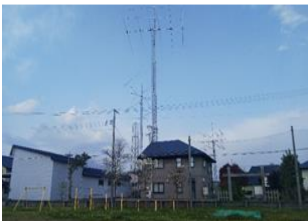
KAZU's home and towers.