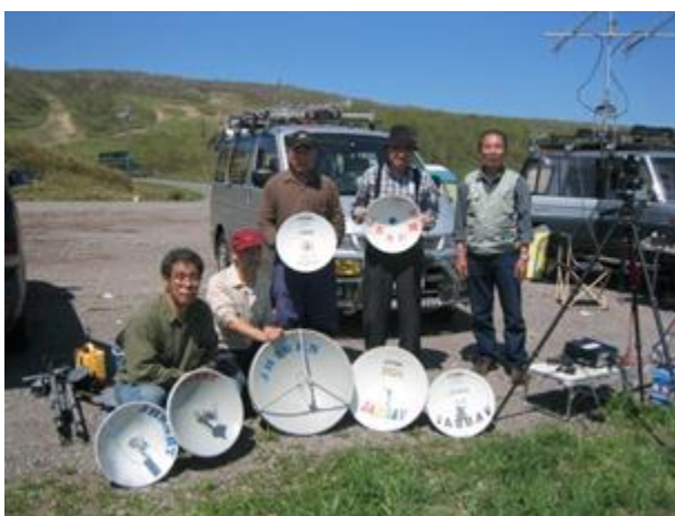
GHz band field activities