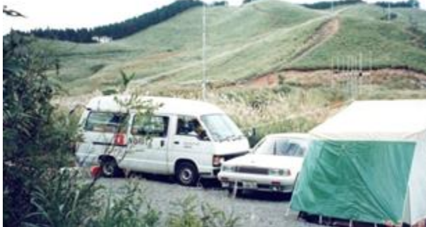
MICHI's mobile operation