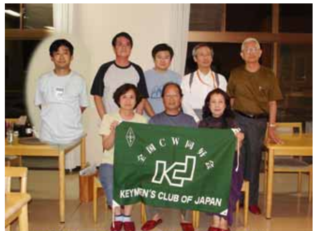
JA6UKY JE6QFP JQ6QUO JG6QFC JA6LVW 2005/10/1 JF6DRD JA6BJV JA6BJW

JA6 area meeting on 1st Oct. Held in Yufu-city Oita, one of newborn cities on the day. They enjoyed the spa there and working more than 1700 QSOs from the new city. CONDX on high-bands were not good but they fully enjoyed the pile-up.