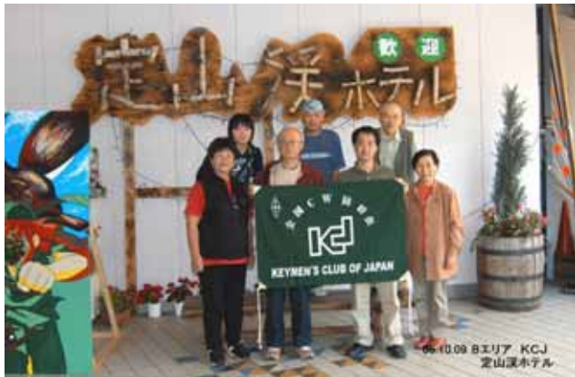
RKV's-Daughter JE8JYD JA8OHG JE8RKV JA8AJE JA8PMN OHG's-XYL

Held in "Jozankei" (Sapporo-city), one of famous spa resorts in Hokkaido. Five members and two guests enjoyed the good spa, delicious dinner and endless chat about ham radio all night long.