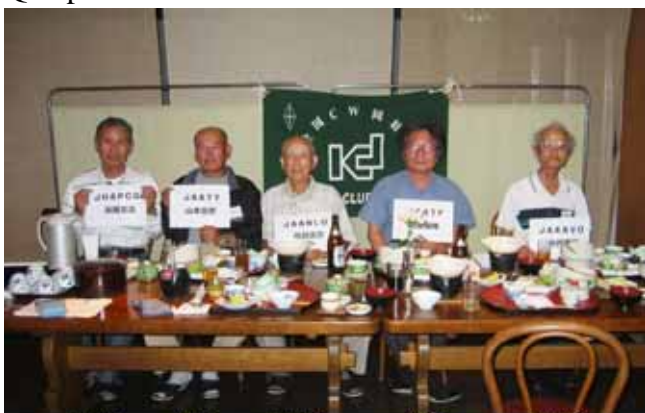
JH4PCD JA4TY JA4BLO JA4TF JA4AVO

JA4&5 area meeting on 1st Oct. Held in Kure-city Hiroshima, where they enjoyed QRPp on 80m-70cm bands.