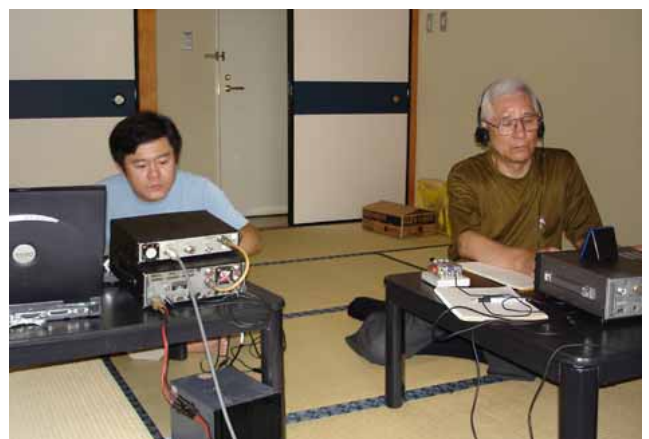
JQ6QUO & JA6LVW