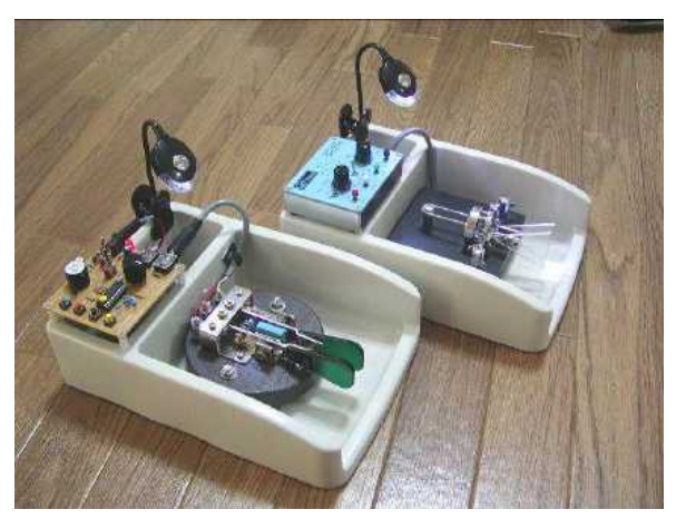
Customizing plastic cases for paddles.