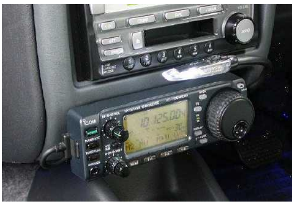
Setting a LED light using the cigar lighter socket.