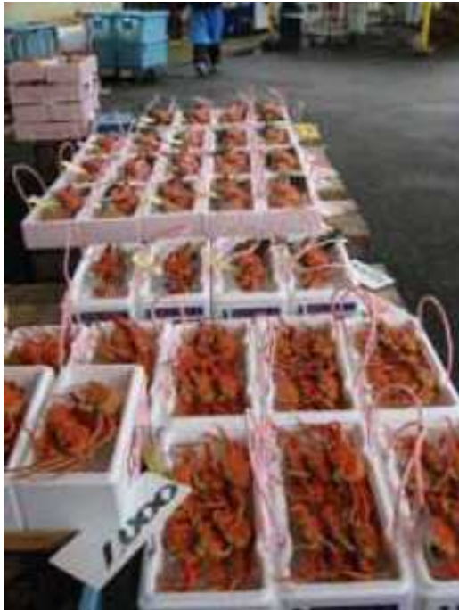
CRAB ! CRAB !! CRAB !!!

We enjoyed them very much and spent a joyful time talking, eating and drinking.