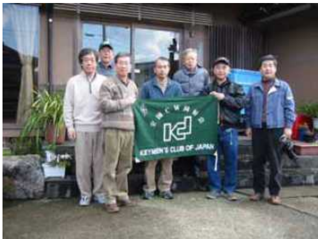
JA1BML JR3SIJ JE3PED JR3XEX JR3KQJ JI3DST JH3HGI