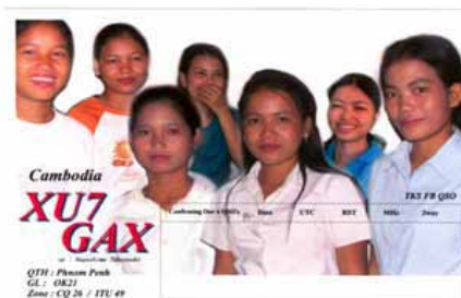
(from The KEY 331)

The XU license is available for one year and the fee is $45. You can get a license if you send $50 and an application form before going there.